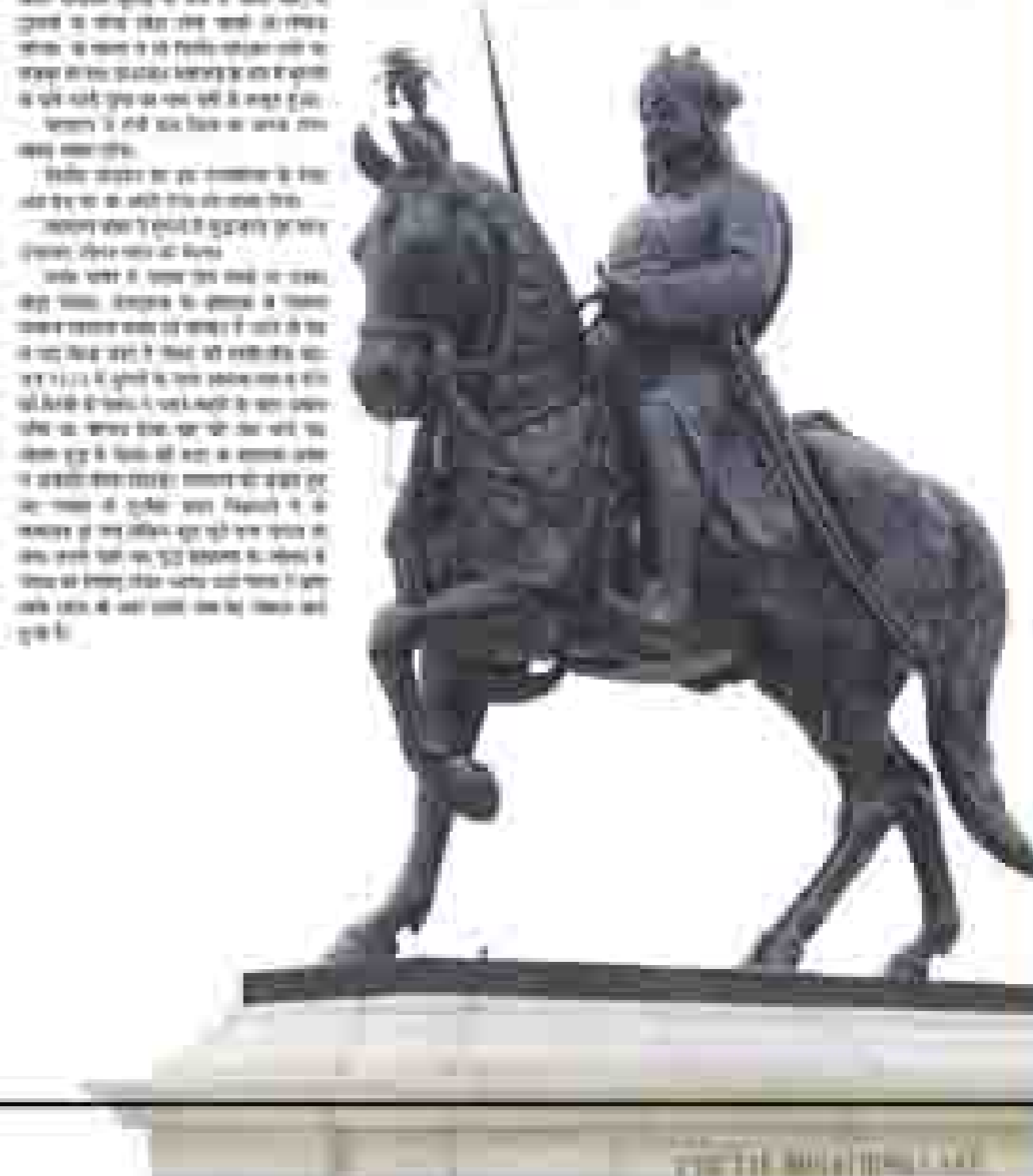
महाराणा प्रताप की प्रतिमा

... महाराणा प्रताप की जयंती 9 मई को मनाया जाता है।